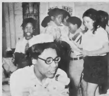
At the Lago Heights Station, girl guides also take the opportunity to make new friendship. Na e stacion di Lago Heights, mlembronan di Antilliaanse Meisjes Gilde ta tuma oportunidad pa haci amistad nobo.

Pa medio di e suceso anual aki, padvindernan di Aruba tin chens no solamente pa tene contacto cu amigonan foi tera, pero tambe pa yuda hiba Aruba su nombre na hopi lugarnan den henter mundo.